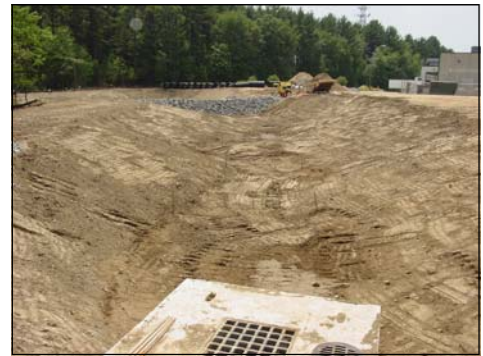
Water Quality Swale Pre-Plant Installation

Runoff was diverted from impervious surfaces into catch basins with deep sumps and hoods to capture sediment and pollutants before being discharged into a constructed Extended Wet Detention Basin. The Stormwater Management Plan was designed to remove approximately 86.5% of the Total Suspended Solids (TSS) exceeding the 80% removal required by DEP.