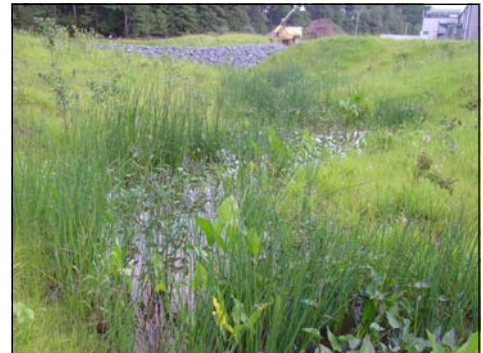
Water Quality Swale 3 Months Post-Plant Installation