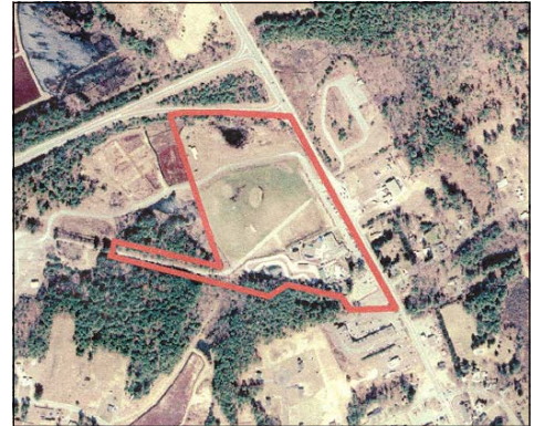
Aerial Photo of Site Pre-construction.

New England Environmental, Inc. provided multiple environmental consulting and restoration services during the planning and development of a supermarket, retail stores, restaurant, and associated parking in Carver, Massachusetts. NEE delineated existing wetland resource areas, filed necessary wetland permits, developed a planting plan, and conducted the restoration of the constructed wetland areas on site.