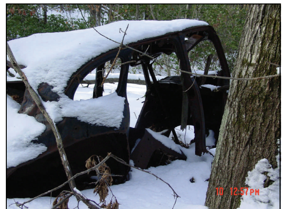
Chevrolet and Ford Automobiles found during Site reconnaissance.